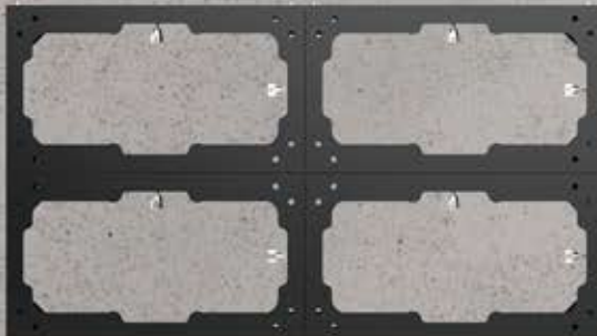
Step1: cabinets mounting