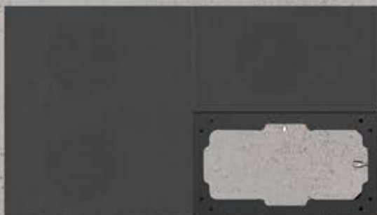
Step4: till the last panel