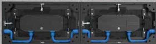
Step3: Join cable with the following panels