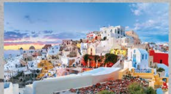
Step5: connect the controller