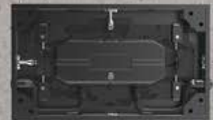
Step2: first panel to go