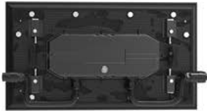
a. LED PANEL